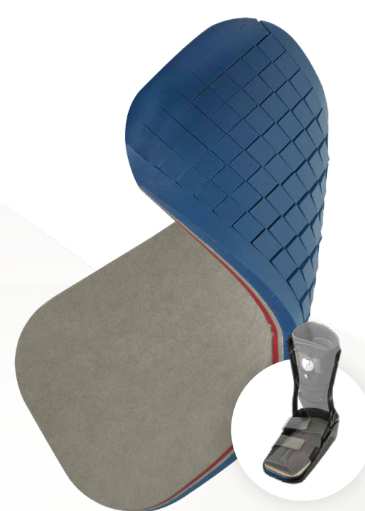
For Therapeutic Boots (Boot not included)