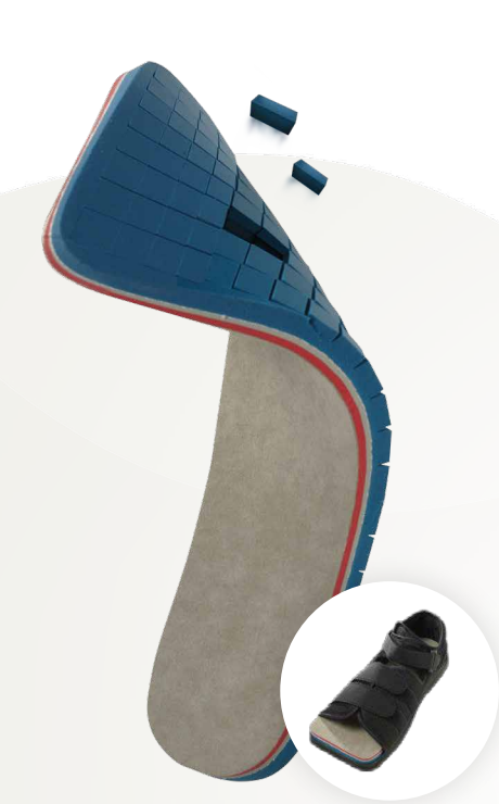
For Surgical Shoes (Shoe not included)